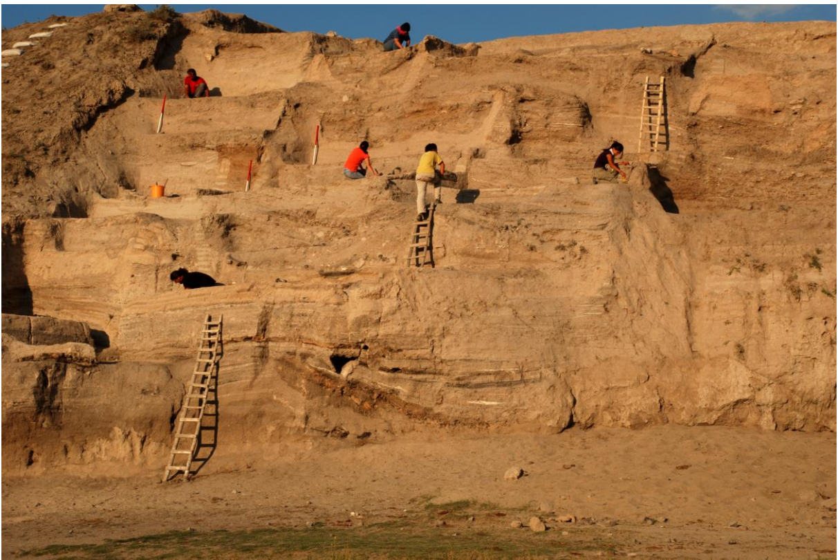
Excavations at Aşıklı Höyük