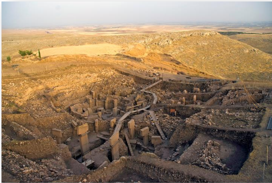
Enclosures at the main excavation area at Göbekli Tepe

21 st -23 rd September 2014, Nevali Hotel, Şanlıurfa, Turkey