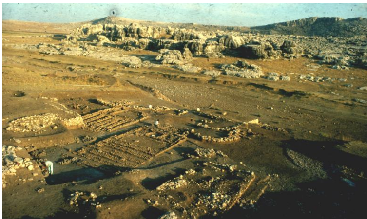
Excavations at Çayönü Tepesi

mainland Europe. The mosaic landscapes of the Republic of Turkey were where this new way of