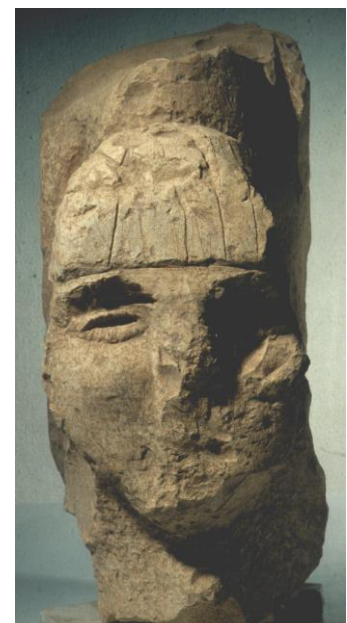
Human stone head from Nevalı Çori