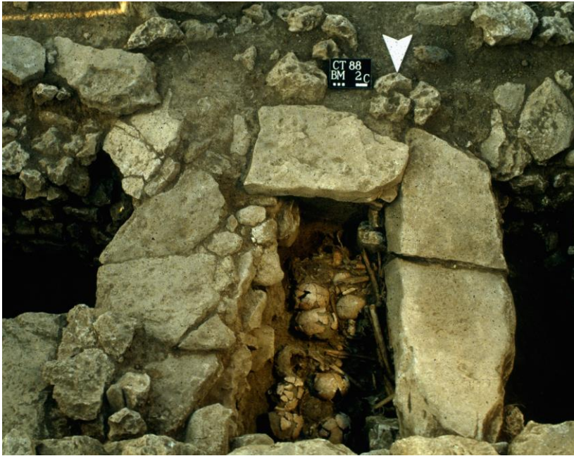
Burials in the so-called Skull Building at Çayönü