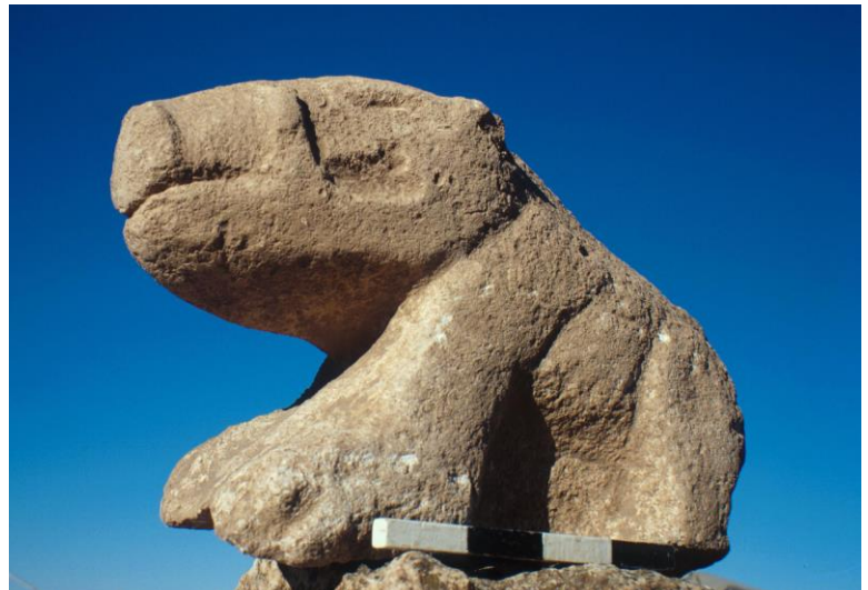
Stone sculptures from Göbekli Tepe © K. Schmidt