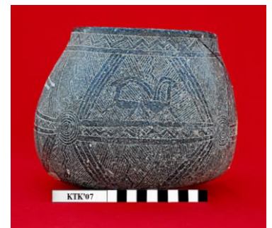
Stone vessel from Körtik Tepe

long-term project. Thus, it is consistent that this early Neolithic cult site, which is on its way to becoming a World Heritage Site, will host an international symposium underlining the site's importance for research and cooperation and further developing its outstanding potential. On-site observation and discussion offer the opportunity to showcase and debate some of the pivotal questions.