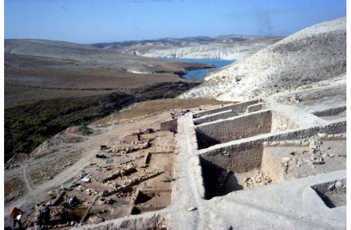
Excavations at Nevalı Çori

These are exciting times. We have known that Southeast Turkey was part of the core area for the earliest large, sedentary communities and the emergence of a farming economy, the so-called Neolithic revolution (10 th -7 th millennium BCE). Now we are learning about the extraordinary cult site of Göbekli Tepe, at the centre of communities across the region, each of which reveals its own architectural and symbolic achievements. For the first time, we are realizing that equally early settlements in central Anatolia were evolving socially and economically in parallel. We are also beginning to see, from excavations in western Anatolia and in European Turkey, evidence of the spread of the Neolithic way of life to Aegean coastlands and islands and into