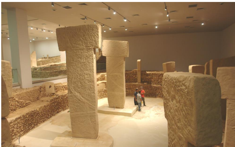
Reconstruction of enclosure D at Göbekli Tepe in the Şanlıurfa Museum

German Archaeological Institute (DAI) Republic of Turkey, Ministry of Culture and Tourism, General Directorate of Cultural Heritage and Museums Government of Şanlıurfa Municipality of Şanlıurfa Harran University