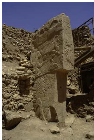
Stone pillar at Göbekli Tepe

Beyond its importance for the heritage of humanity, Göbekli Tepe, situated in Southeastern Turkey, is an important location for German-Turkish cooperation in prehistoric archaeology. The site is being studied by an interdisciplinary team of scholars funded by DFG in the framework of a