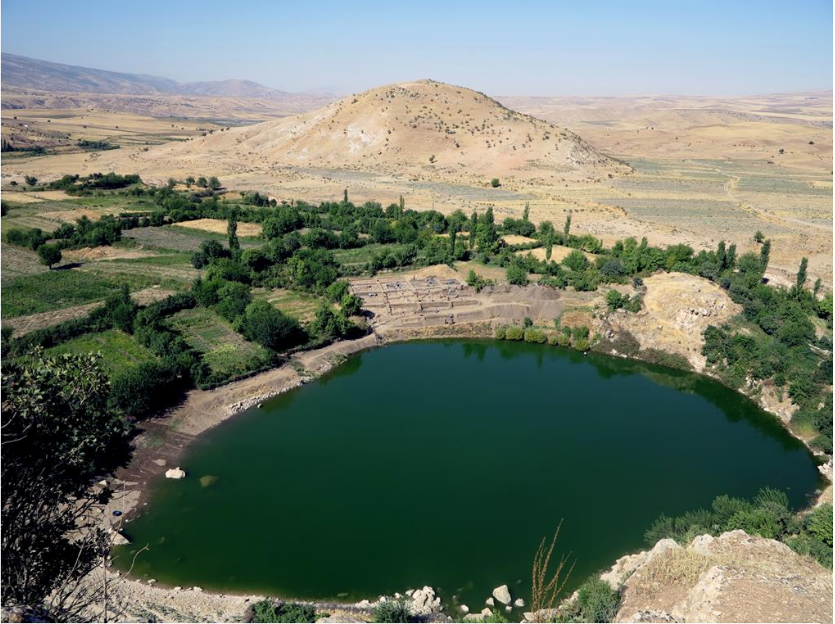
View towards the excavation area at Gusir Höyük