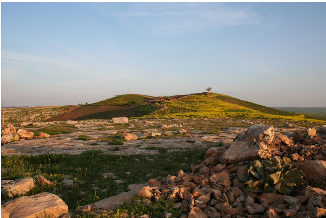
View towards the site of Göbekli Tepe